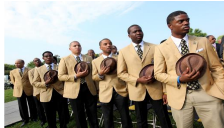
Surviving the Fight